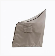
Raincover With Raincover