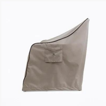
Raincover With Raincover