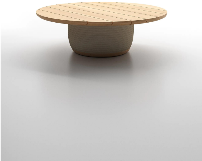
Table top Solid teak wood FSC 100%Substructure Aluminium powder coatingBase Wickered aluminium structure in polypropylene ropeFittings Stainless steel 304Glides PA rubberDining tables Include adjustersPackaging Carton box double wall K275, plastic free

Grao Collection is a manifestation of how the Mediterranean and Asian influences come together in harmonious design. This collection reflects a seamless blend of cultures. Like a universal language that connects traditions, the use of rope in Grao allows its design to adapt effortlessly to various outdoor spaces. With a refined texture, dynamic patterns, and uniquely structured rope fabric that interacts with its surroundings, Grao seamlessly integrates into any setting. Whether in a tropical garden, an urban rooftop, or a beachfront villa terrace, Grao brings an elegant and natural touch to every space.