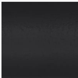
Default configuration: Grey Sand Texture