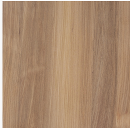
Default configuration: Natural Teak