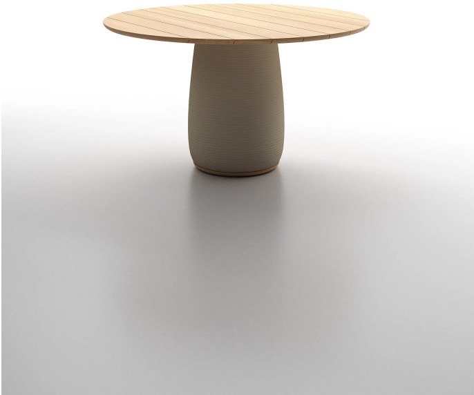
Table top Solid teak wood FSC 100%Substructure Aluminium powder coatingBase Wickered aluminium structure in polypropylene ropeFittings Stainless steel 304Glides PA rubberDining tables Include adjustersPackaging Carton box double wall K275, plastic free"

Grao Collection is a manifestation of how the Mediterranean and Asian influences come together in harmonious design. This collection reflects a seamless blend of cultures. Like a universal language that connects traditions, the use of rope in Grao allows its design to adapt effortlessly to various outdoor spaces. With a refined texture, dynamic patterns, and uniquely structured rope fabric that interacts with its surroundings, Grao seamlessly integrates into any setting. Whether in a tropical garden, an urban rooftop, or a beachfront villa terrace, Grao brings an elegant and natural touch to every space.