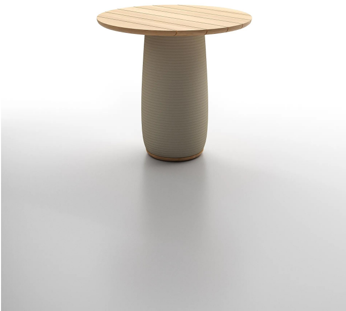
Table top Solid teak wood FSC 100%Substructure Aluminium powder coatingBase Wickered aluminium structure in polypropylene ropeFittings Stainless steel 304Glides PA rubberDining tables Include adjustersPackaging Carton box double wall K275, plastic free

Grao Collection is a manifestation of how the Mediterranean and Asian influences come together in harmonious design. This collection reflects a seamless blend of cultures. Like a universal language that connects traditions, the use of rope in Grao allows its design to adapt effortlessly to various outdoor spaces. With a refined texture, dynamic patterns, and uniquely structured rope fabric that interacts with its surroundings, Grao seamlessly integrates into any setting. Whether in a tropical garden, an urban rooftop, or a beachfront villa terrace, Grao brings an elegant and natural touch to every space.