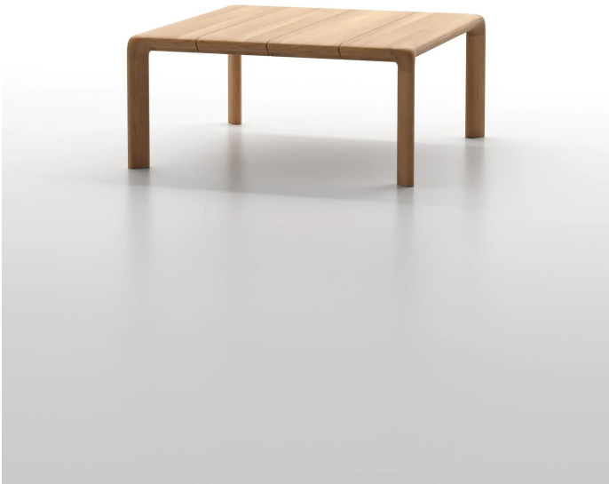
Table top Solid teak wood FSC 100%Substructure Aluminium powder coatingFittings Stainless steel 304Glides PA rubberDining tables Include adjustersPackaging Carton box double wall K275, plastic free"

The Marie Collection showcases sensual curves that create a visual dialogue between design and comfort. These soft curves not only enhance aesthetics but also elevate the seating experience with impeccable ergonomic support. Crafted from durable and eco-friendly teak, this collection embodies functional beauty. From leisurely afternoons to intimate gatherings under the stars, Marie enhances every moment with natural elegance. With a seamless blend of aesthetics and functionality, this collection is the perfect choice for those who prioritize comfort without compromising on style.